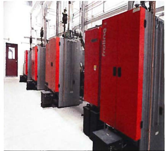
Both Boiler Rooms look nearly identical