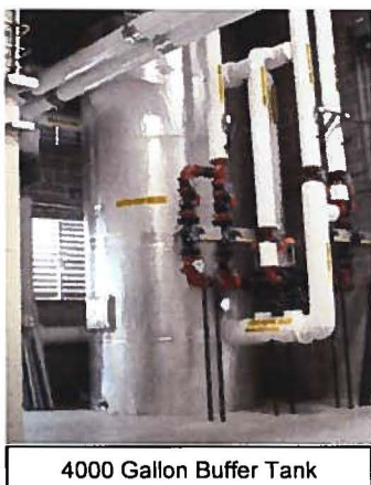
4000 Gallon Buffer Tank